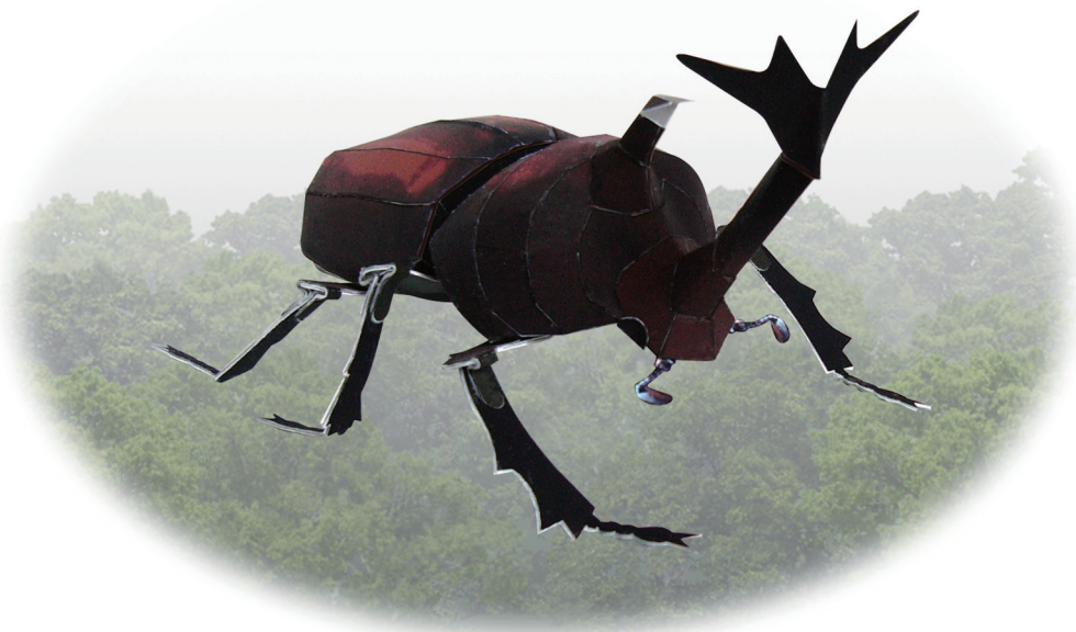
View of completed model